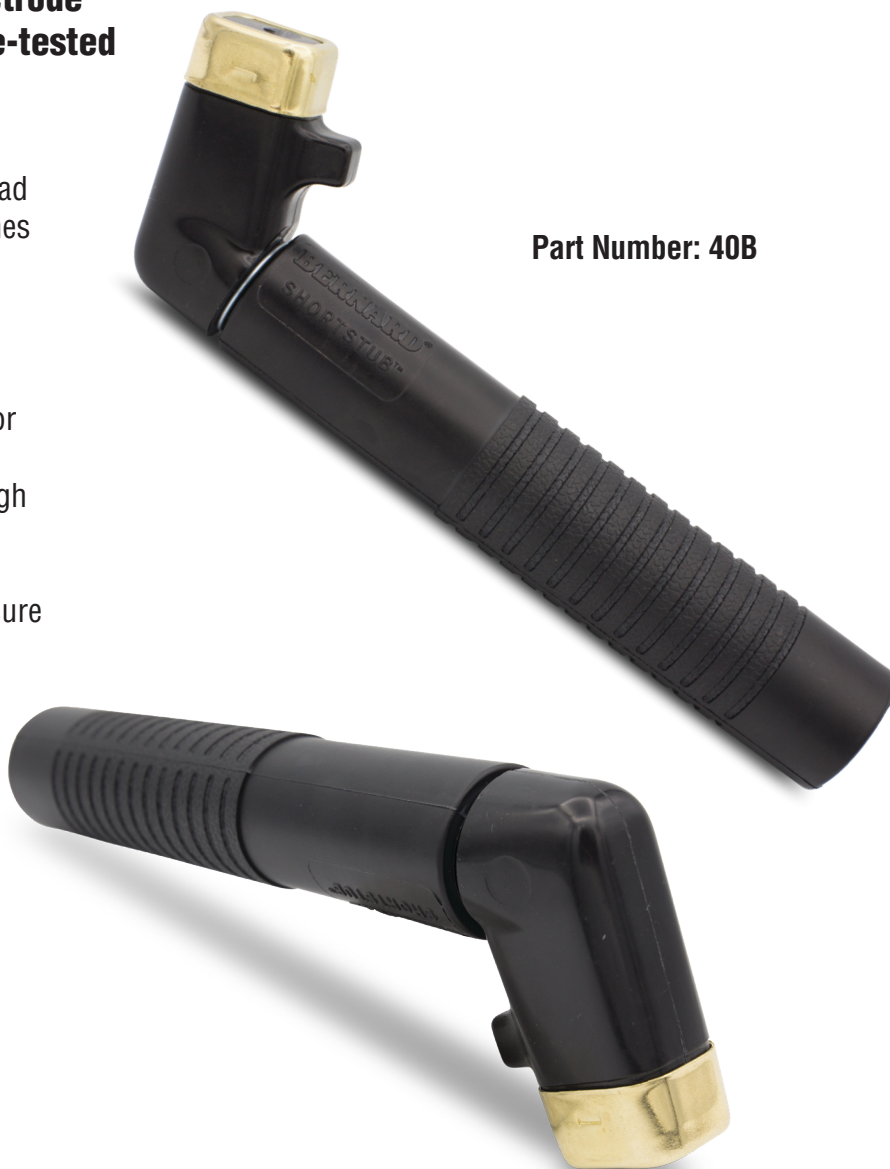
Part Number: 40B

Over 2,000 pounds of gripping pressure enables the electrode to be bent to a desired shape for access to difficult welds.